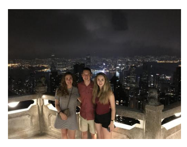
Victoria Peak, Hong Kong

There are several optional faculty-led travel opportunities within mainland China.