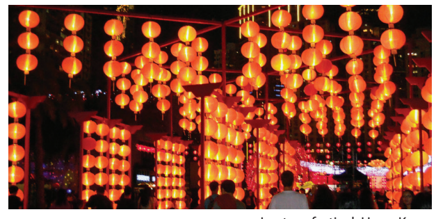
Lantern festival, Hong Kong