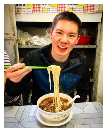
Noodles in the Hong Kong market

Hong Kong Baptist University has a warm, studentfriendly environment. The student body is almost entirely Chinese. There are approximately 1,200 Chinese Christians in the student body, but there is a Muslim-Buddhist-Hindu majority. This, together with a strong North American/European/Australian influence on the faculty and the mix within the global community in Hong Kong, forms the basis for a remarkably diverse multicultural experience on campus.