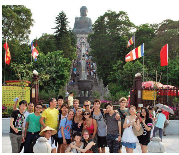
Big Buddha at Lantau Island, Hong Kong