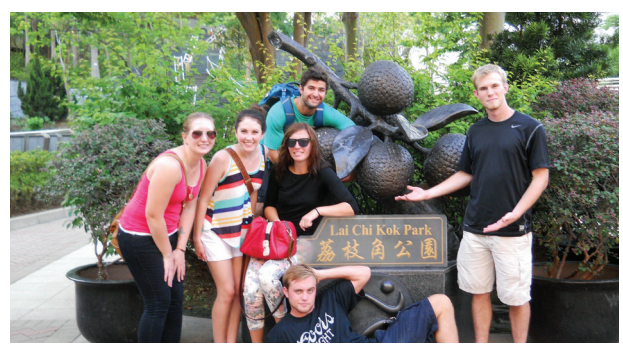
Lai Chi Kok park, Hong Kong

Students may choose either a fall semester or a spring semester. Fall semester runs from approximately the end of August to the third week of December. Spring semester runs from approximately the first week of January to the end of May.