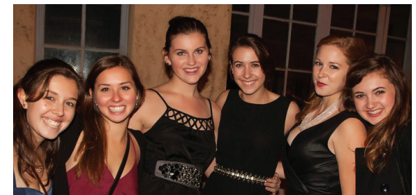
The Gala, Aix, France

IAU College, Aix-en-Provence www.iaufrance.org