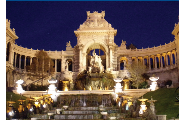
Natural Science and Art Museum, France

Linfield Students may choose between two universities: University of Burgundy which is located in Dijon, France and IAU College which is located in Aix-en-Provence, France.