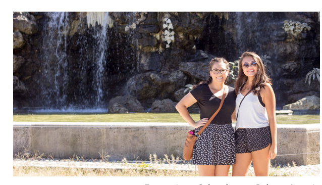
Fountain at Schonbrunn Palace, Austria

Linfield College has a partnership with the Austro-American Institute of Education. Bordering eight countries, Austria lies at the crossroads of Western and Eastern Europe, providing a perfect base for European study. This program is only available during fall semester.