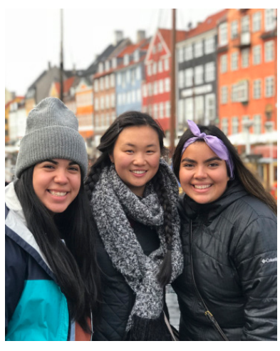
Linfield Students in Austria During the Fall of 2018