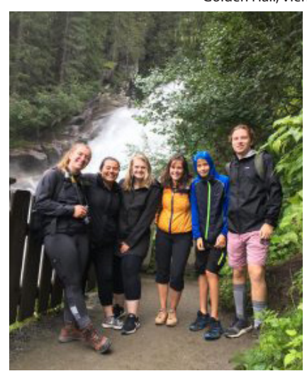
Krimmel Falls, Dorfgastein, Austria