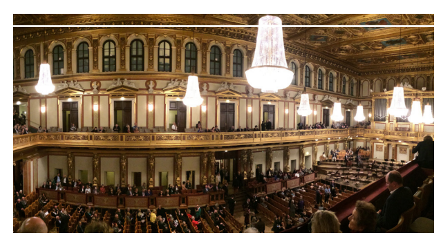
Golden Hall, Vienna, Austria

Following your time in Dorfgastein, you will be transported to Vienna for the rest of the semester. You will have a home stay experience with an Austrian family for the remainder of your stay in Vienna.