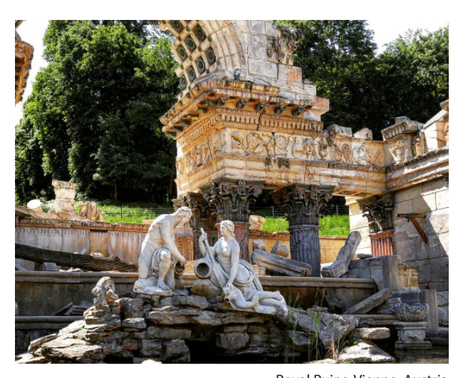
Royal Ruins, Vienna, Austria

The program is open to students in good academic and social standing who have completed at least one semester at Linfield with a 2.75 minimum cumulative GPA. Students cannot participate in both a semester abroad and January Term off-campus course in the same academic year without special permission from the International Programs Office. On the basis of an application, supporting documents and interview, a selection committee judges each application to determine motivation, readiness and academic preparation for this study abroad experience. A mandatory orientation meeting takes place in the spring semester prior to departure.