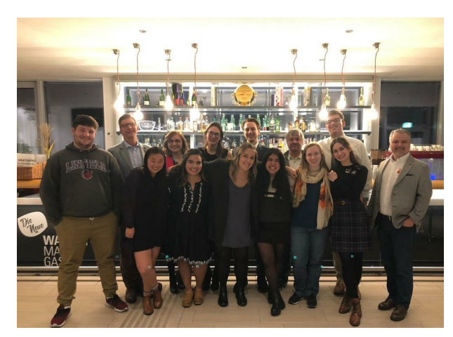
Thanksgiving in Austria