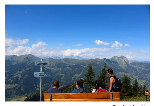
The Austrian Alps

Estimated budgets for personal expenses can be obtained in the International Programs Office.