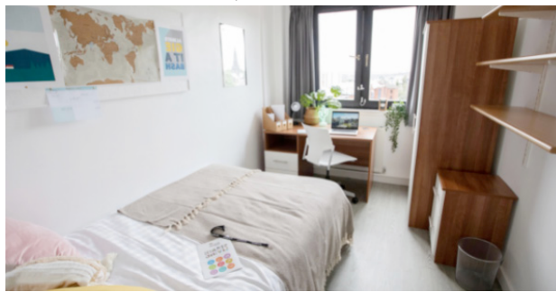
Standard Ensuite Room

We have good availability of accommodation within a 10 minute walk of the academic buildings. Options will depend on your semester of study. Transportation around the city is available through buses, trains, scooters and bikes. No standard meal plan; students pay as you go. More detailed information is available at https://isc.strath.ac.uk/international-study-centre/accommodation