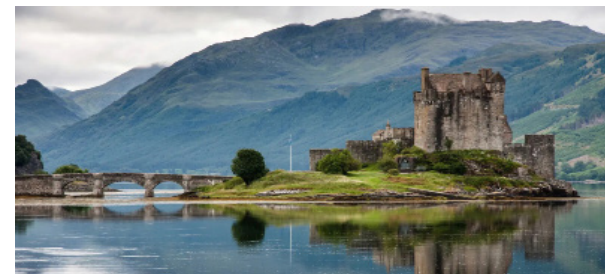
The Eilean Donan Castle in Loch Duich, Scotland.

Located in the heart of the city of Glasgow, campus has a proper Scottish feel - open and friendly. Glasgow has a variety of amenities and is easy to navigate.