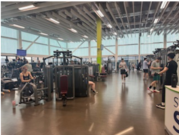
The University has an upgraded Student Union and fitness facility, including a pool.