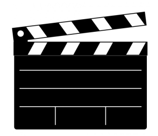
AUDIO/VIDEO Promotional videos, interviews, commercials, events