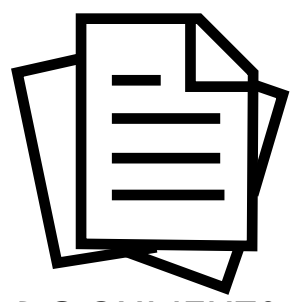
DOCUMENTS Legal/business documents, newsletters, reports, correspondence, minutes